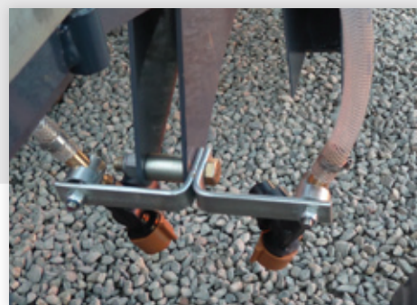
OPTION Liquid spraying system