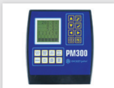
OPTION Cabin planter controller