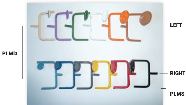
Spoon sizes 17 - 21 - 24 - 27 - 30 - 33mm