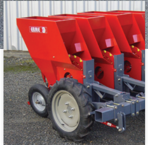
INDIVIDUAL PARALLELOGRAM MOUNTED ROWS FOR UNIFORM PLANTING AND GERMINATION