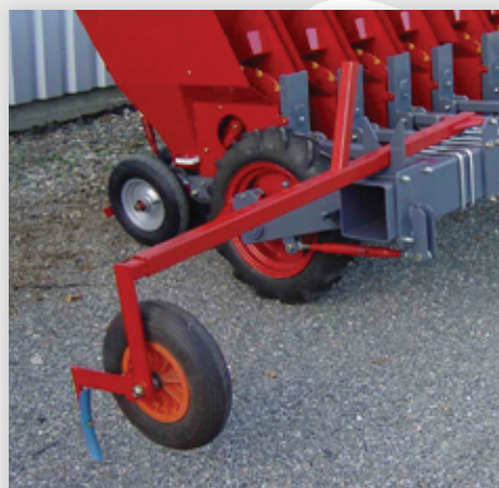
OPTION Tractor wheel markers (mechanical /hydraulic)