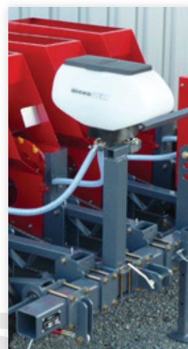
OPTION Insecticide micro granulator