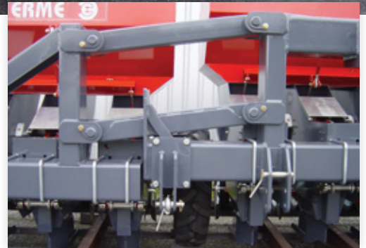
REINFORCED CHASSIS WITH PARALLELOGRAM FRAME FOR MULTI BED MACHINES